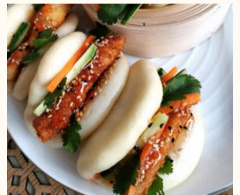
8 Baos of your choice: - Roast Pork/Tofu/ Grilled Chicken