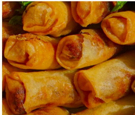
Spring Rolls (30 pcs )