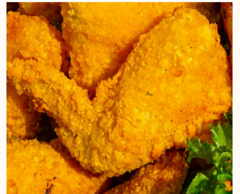
Fried Chicken Wings(20 pcs)