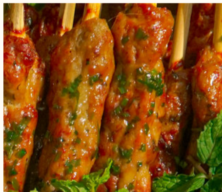
Chargrilled Nem Nuong (10 pcs)